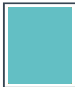
FULL PAGE Type area - 18.5 cm x 21.9 cm Trim size - 21 cm x 27 cm Bleed size- 21.6 cm x 27.6 cm