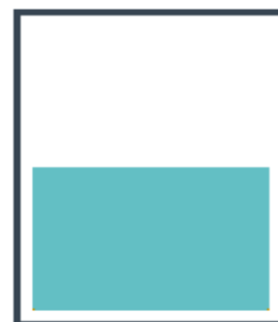
HALF PAGE Type area - 18.5 cm x 11.5 cm Trim size - 21 cm x 13.5 cm Bleed size- 21.6 cm x 14. cm